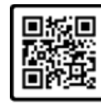
Donate to Auxiliary

New in 2023, the ACOFP Foundation established a fund to support scholarships to students via the Auxiliary Fund. Donations to this fund are tax-deductible and support the following initiatives: