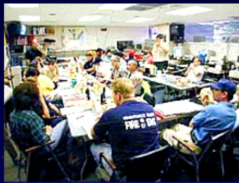
Coordination Groups/Department Operations Centers