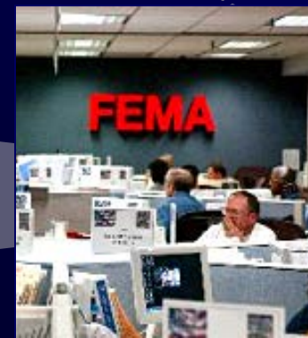
Resource Coordination Centers