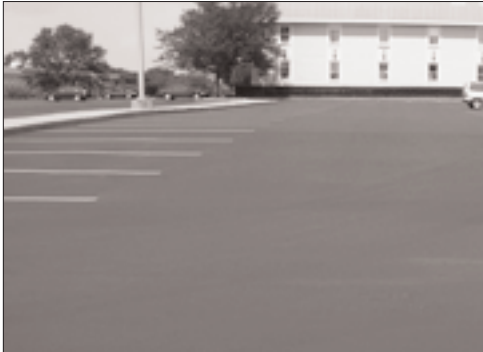
2450 East Devon Street, Des Plaines, IL, 1982-1990