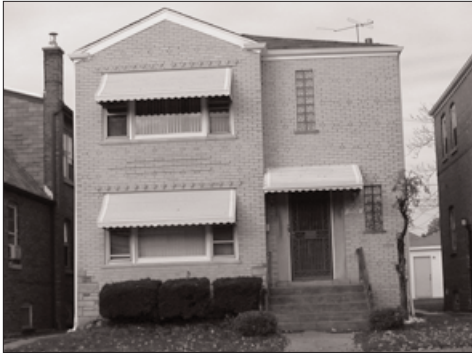
7926 South Campbell Avenue Chicago, IL, Early 1960s-1970