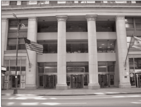
111 West Washington Street, Chicago, Il. 1978-1982