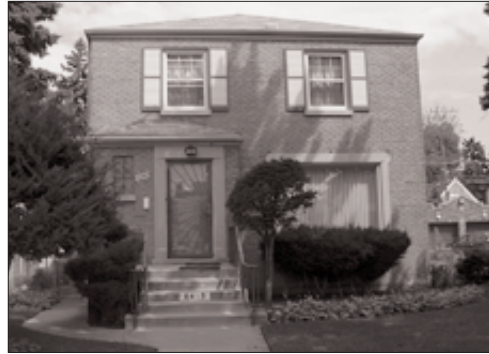
8415 South Winchester Avenue Chicago, IL, 1970-1978