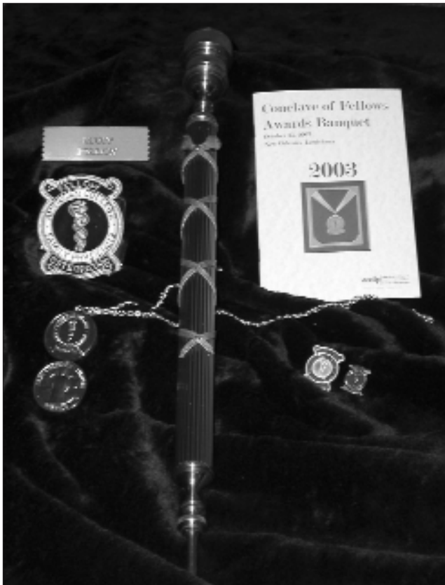
The official regalia of the ACOFP Fellow Designation.